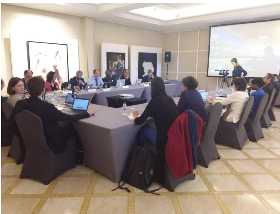
Figure 1. First STC meeting, Morocco, 2016

The first STC meeting was convened during the UNFCCC COP22 in Morocco in 2016 (Figure 1). It was an introductory meeting held under the auspices of the French Government.