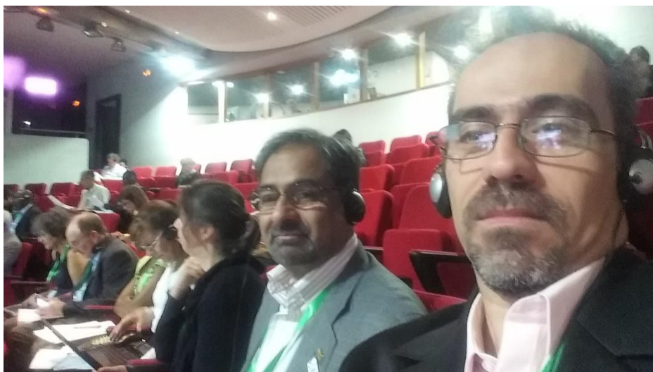
Figure 3. 3rd STC meeting in Montpellier (France), 2017