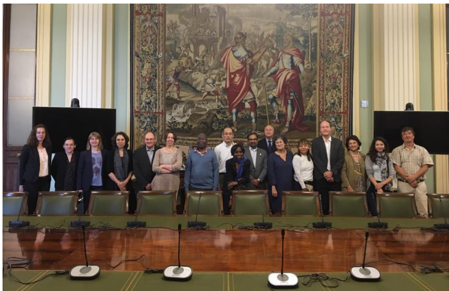
Figure 5. 5th STC meeting in Madrid (Spain)