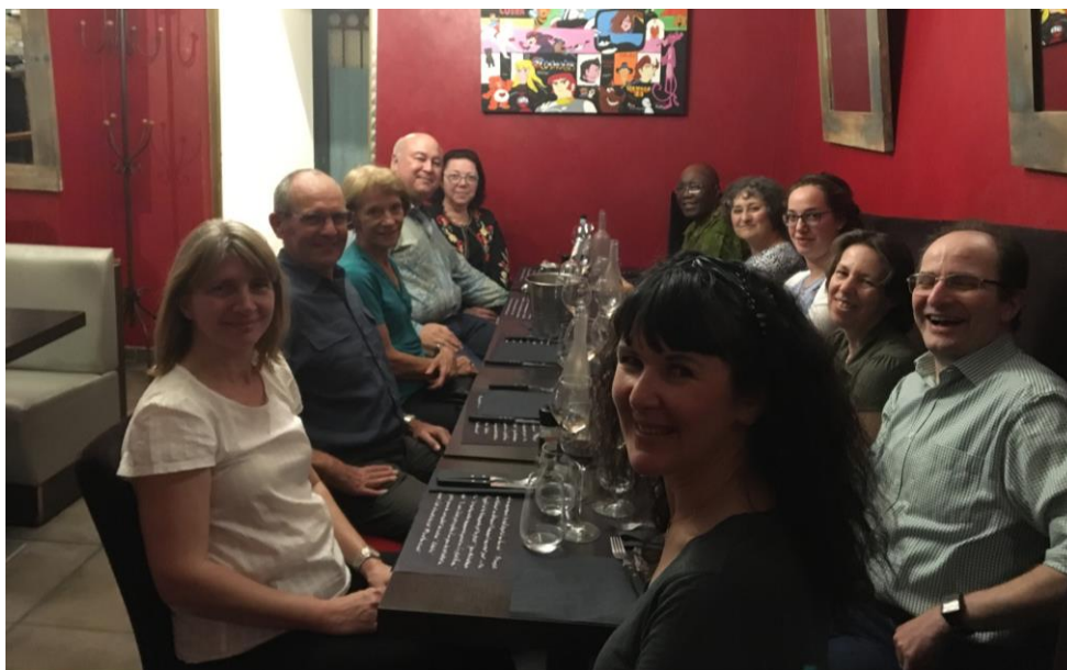
Figure 7. 7th STC meeting in Montpellier (France)

STC launched a topic collection of scientific articles on Soil carbon sequestering practices as an important knowledge gathering step.