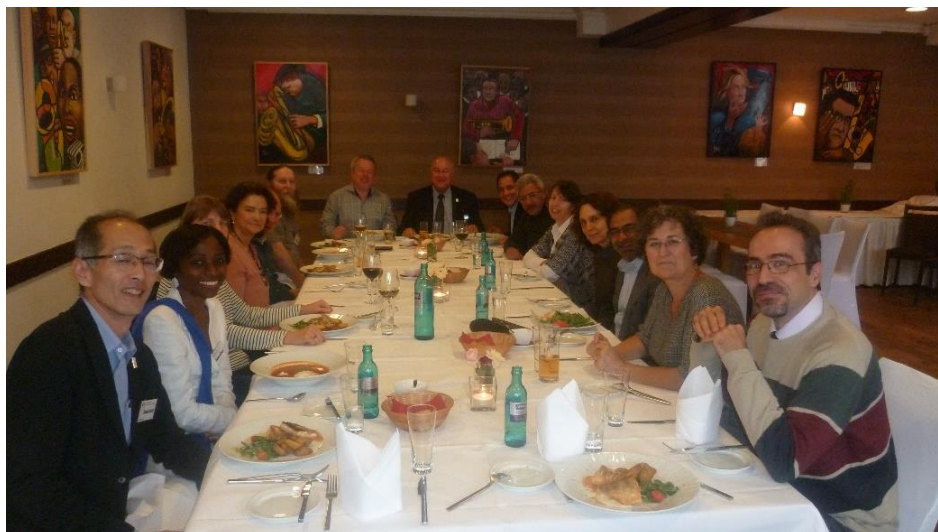
Figure 4. 4th STC meeting in Bonn (Germany), 2017