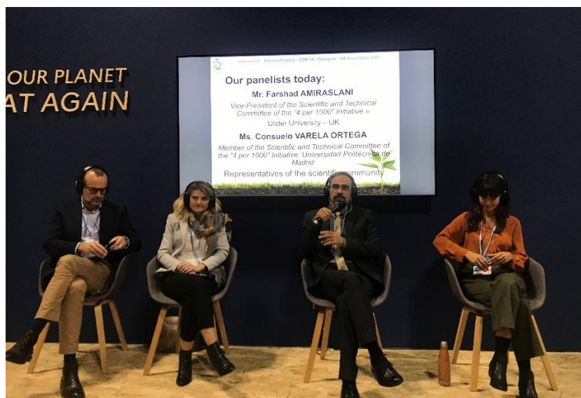
Figure 11. Panel on the French Pavillion at UNFCCC COP26, 2021 (Glasgow, UK)

STC members attended side-event at the French Pavillion in the COP26 Hall and, as panel speakers, talked about the relationship between food security and climate change. The central proposition of how to translate research into real action in the field was discussed.