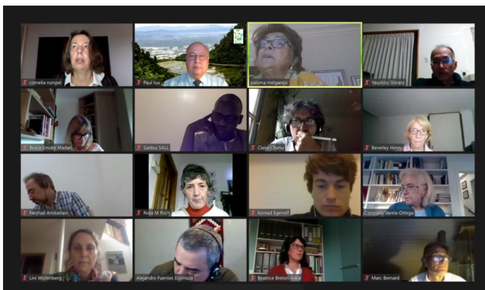
Figure 9. 10th STC On line meeting, 2020