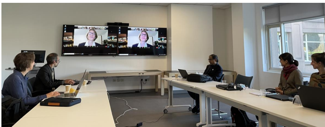
Figure 10. 12th STC meeting during the UNFCCC COP26, 2021 (Glasgow, UK)

The meeting was held in a hybrid way where STC members attended in-person and virtually in Glasgow (UNFCCC COP 26).