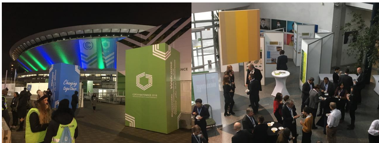
Figure 6. 6th STC meeting during the UNFCCC COP, 2018 (Katowice, Poland)