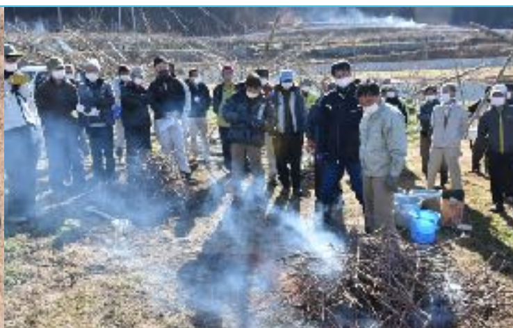
Carbonisation test