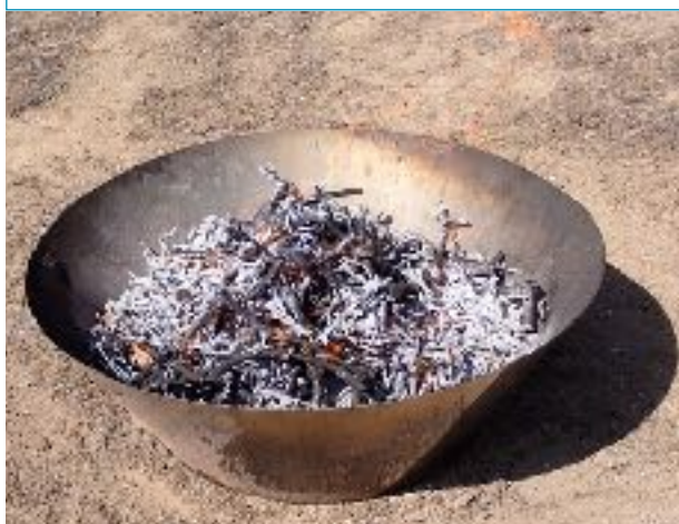
Biochar in the making