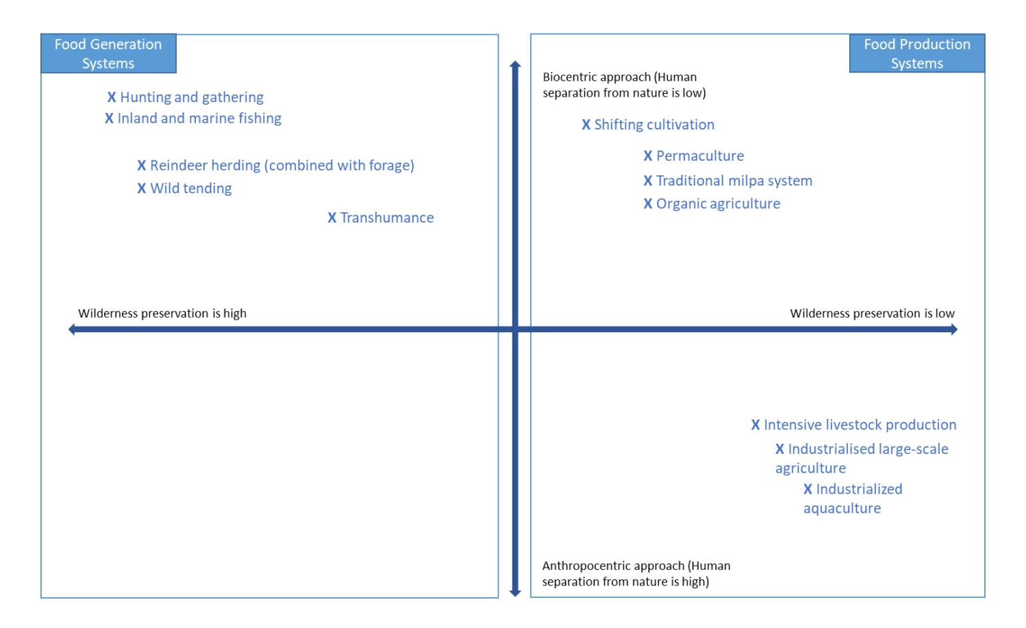
Figure 2: Example of food systems regarding the level of human intervention on the ecosystem and the approach underlying territorial management choices (anthropocentric, biocentric).

Indigenous Peoples' food systems are efficient in their use of resources, with no waste and circulation of resources. Indigenous Peoples' food systems are efficient in using food and other resources, with zero or minimal waste generated and wide circulation of resources, products and non-monetary wealth within communities, as exemplified by the rule of "take only what you need and share the excess". All the materials used tend to be fully utilised and recycled locally. In their food system, Indigenous Peoples reuse organic matter for agricultural production, which they consider as a resource more than as a waste (FAO and the Alliance of Bioversity International and CIAT, forthcoming-a). In contrast, recent studies on food loss and waste have calculated organic waste from global, conventional food systems equates to 1.3 billion tons of waste per year (FAO, 2020a). Another commonly held belief and practice amongst Indigenous Peoples is to use all parts of the plant or animal harvested, to fully honour the life given. The Inuit make walrus ivory artwork and sealskin clothing, and their crafts represent a full expression of their culture and respect for the gift of marine mammals. Their craftwork is also an important economic feature and expression of cultural identity of their subsistence hunting.